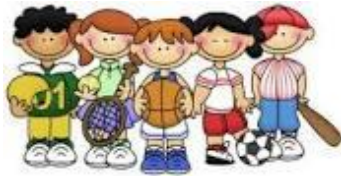
PE and Health

In class we will also be working on 3D construction as well as exploring and creating pieces of art using pencil, pastel, dye and paint.