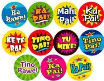
Te Reo and Kapa Haka

This term we will be doing a syndicate sports rotation on a Wednesday afternoon. The focus will be around building the children's skills in athletics with a strong focus on long jump, high jump, sprinting, relays and distance throwing. It would be great if your child could wear sensible running shoes and clothes that they can move in freely.