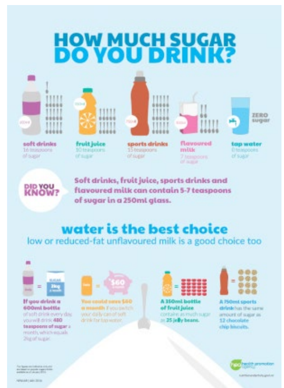
Schools infographic: How Much Sugar Do You Drink?

The Bee Healthy Regional Dental Service has some tips about keeping your smile. Click HERE to download.